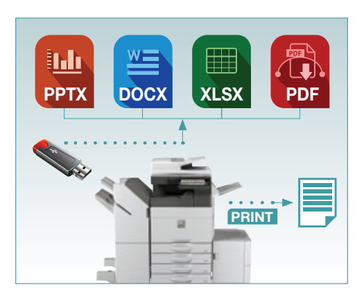
Direct print to popular file formats seamlessly with Sharp's available Direct Print Expansion Kit.<sup>1</sup>