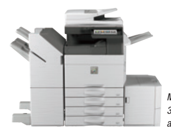
MX-6050V shown with 3K saddle stitch finisher and large capacity cassette.