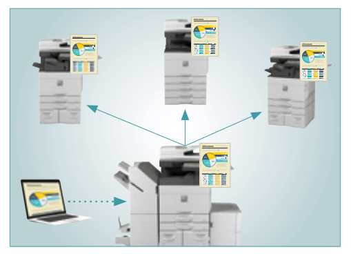
With Serverless Print Release technology you can securely print a job and release it from any of six color Essentials Series models.