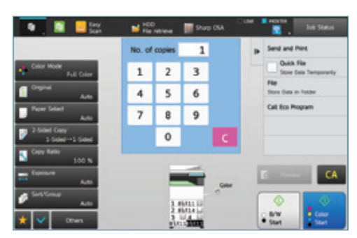
Standard Copy Screen offers more advanced features.