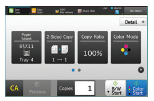
Easy Copy Screen offers the most commonly used settings.