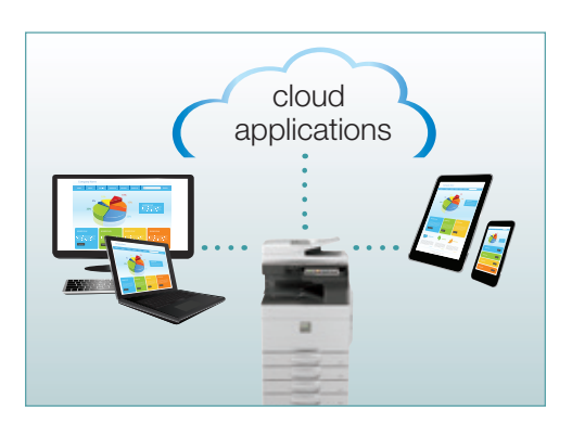
Distribute, access and print documents more easily.