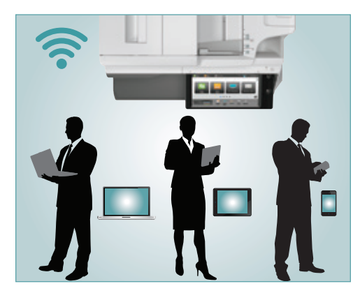
Available wireless network interface for convenient scanning and printing from mobile devices.