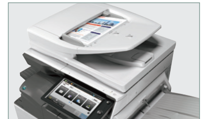
Sharp's ImageSEND™ feature provides one-touch distribution to email, cloud applications and more.