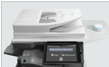
MX-4051 shown with available Sharp MFP Voice feature with Alexa.