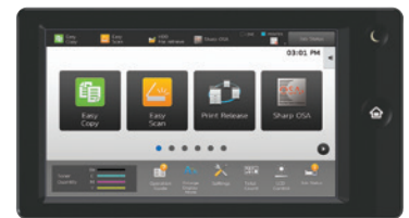
Award-winning 10.1" (diagonally measured) customizable touchscreen display.