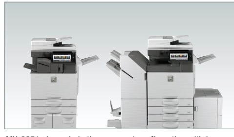
MX-3051 shown in both a compact configuration with inner finisher and full configuration with saddle stitch finisher and large capacity cassette.