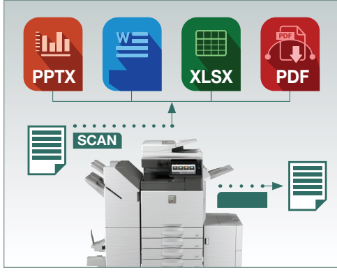
Scan and convert documents to popular file types with optional OCR Expansion Kit.