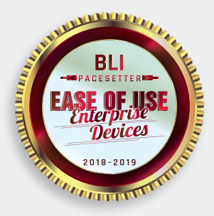
"PaceSetter Award in Ease of Use 2018–2019"