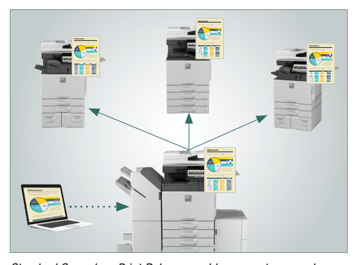
Standard Serverless Print Release enables users to securely print a job and release it from up to six supported models on the same network.