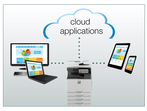
Access popular cloud applications, distribute files and print documents more easily.