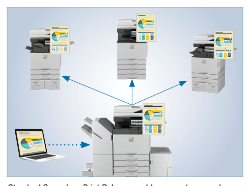
Standard Serverless Print Release enables users to securely print a job and release it from up to six supported models on the same network.