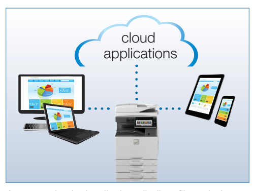
Access popular cloud applications, distribute files and print documents more easily