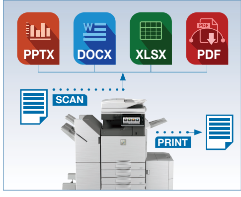
Scan and convert documents to popular file types seamlessly with Sharp's built-in OCR function.