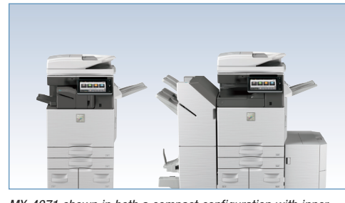
MX-4071 shown in both a compact configuration with inner finisher and full configuration with saddle stitch finisher and large capacity cassette.