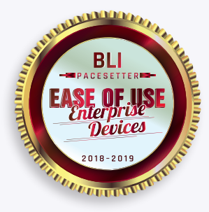
"PaceSetter Award in Ease of Use 2018–2019"