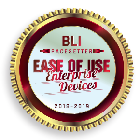
"PaceSetter Award in Ease of Use 2018–2019"