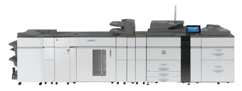
MX-M1204 High Speed Monochrome Document System shown with GBC SmartPunch Pro.