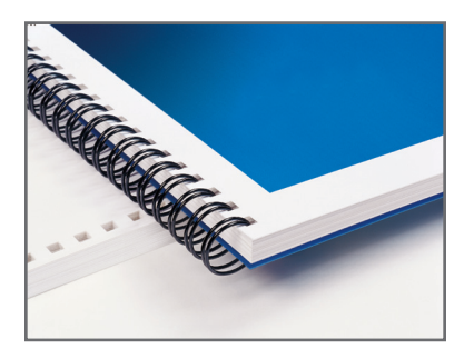
Available binding styles such as WireBind offer your customers a professionally finished document.