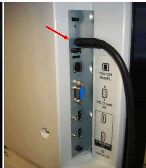
Adapter connected to RS-232C port

Design and specifications subject to change without notice.