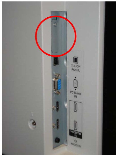
AQUOS BOARD™ w/cover